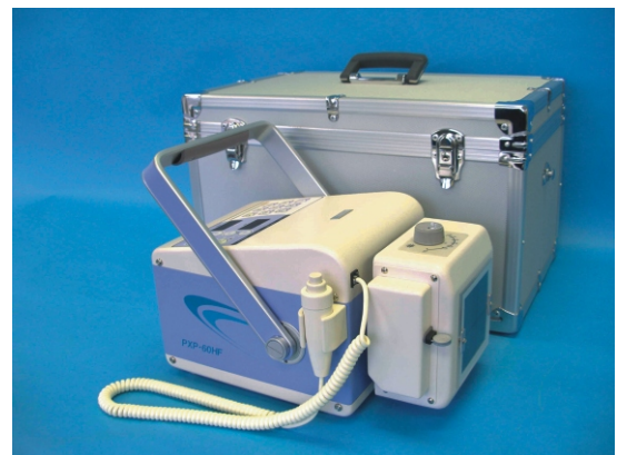
PXP-60HF & CARRYING CASE

MOST POWERFUL, LIGHT WEIGHT AND RELIABLE HF PORTABLE X-RAY UNIT